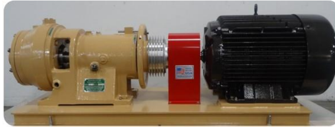
STANDARD CHARLOTTE "G" MODEL GREASE PRODUCTION MILL