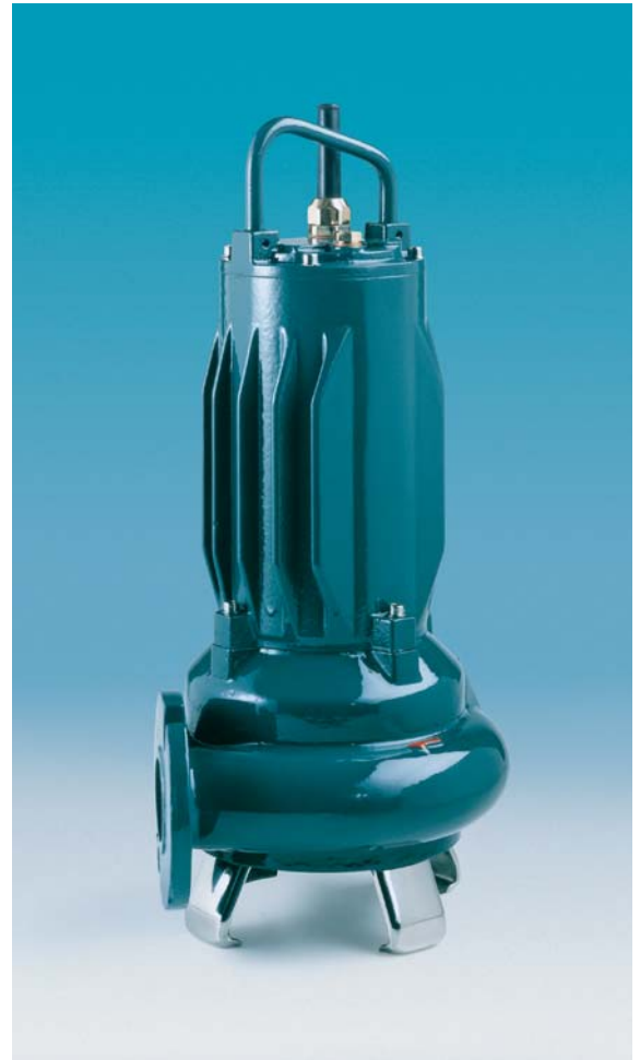
TABLE OF MATERIALS