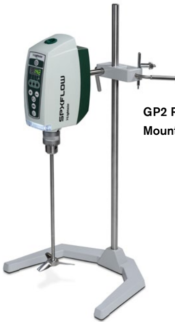
GP2 Rod Mount