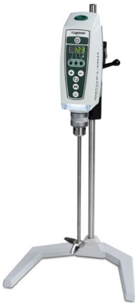
GP2 Universal Clamp Mount